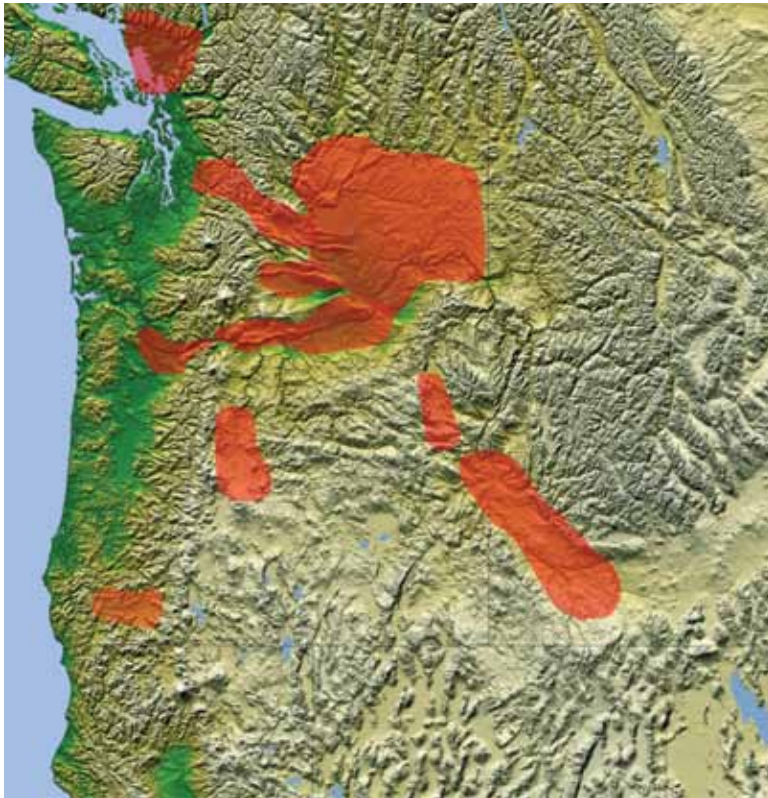
Fig. 2 – Favored locations for freezing rain in Seattle Center’s airspace.

“With the amount of strong wind we get, it’s not impossible for us to have wind chill factors of -60 F” says Jay Flowers, FAASTeam Program Manager and Safety Inspector at the Flight Standards District Office in Fargo, ND. “You won’t fall short of finding a flat place to land in an emergency, but surviving the cold before help arrives is a whole different story.” With the extreme cold conditions in these areas, Flowers recommends pilots be mindful of the proper clothing and survival gear before stepping inside the aircraft. “If there are below-freezing temperatures and any wind at all, survival times can go from hours to mere minutes.”